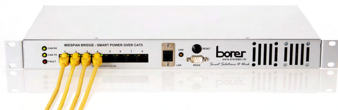
RACK MOUNTING MIDSPAN BRIDGE Part No. 04-137